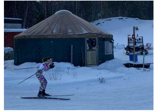
High School racers on the course in Section 2

As of now racing has not begun in Section 3, 7, or 9. We look forward to seeing all teams around the state have the opportunity to race in a safe and healthy environment.