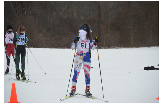
Masks and Social Distance the norm for this year