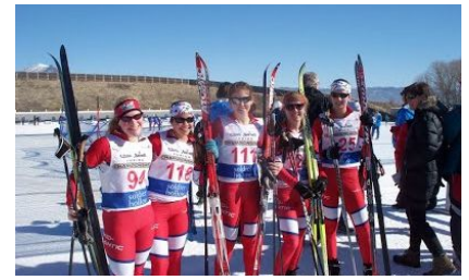
Mid A Racers at Nationals. Get out and race. This year's nationals are in Truckee, California