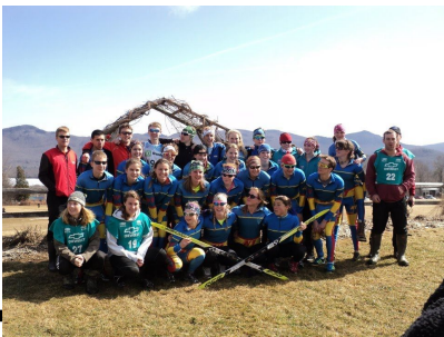
Eastern High School Championship team

be the Team Leader for both these events. Get involved and help New York to race a full team for these events. This is a weekend commitment and is a great opportunity for our athletes to race against the teams from Vermont, New Hampshire, Maine, and Massachusetts.