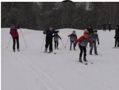
Fun on the snow. The next generation getting it done