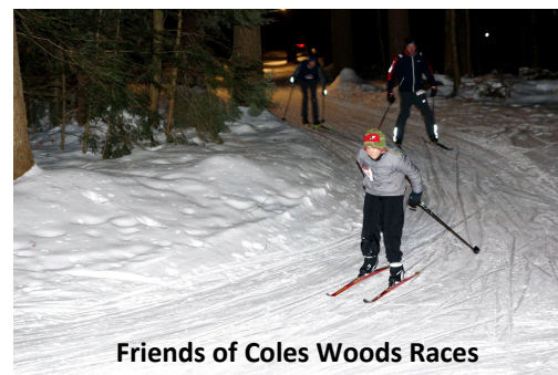
Friends of Coles Woods Races under the Lights

Make the best of the season and get out there and enjoy all there is about Nordic Skiing and racing.